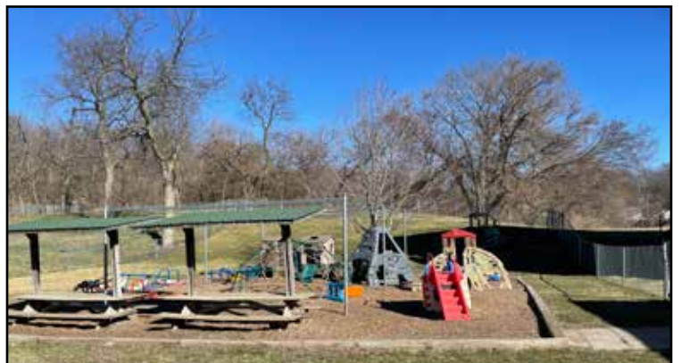
Kids Corner outdoor play area. MORE PICTURE ON PAGE 2.