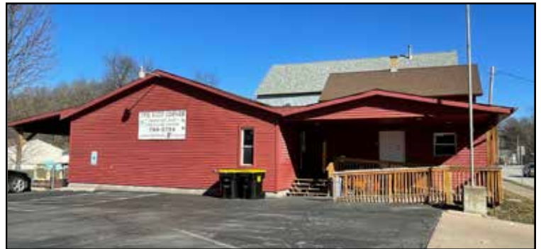
Kids Corner. 2210 1st Street, Coal Valley.