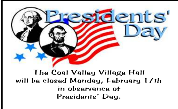
The Village News- February 2025 PAGE 3